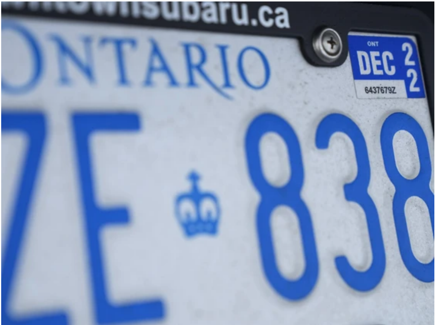
A photograph of an Ontario provincial licence plate with a renewal sticker is shown in Mississauga, Ont., on Tuesday, Feb. 22, 2022.

OPP are reporting increasing numbers of motorists with expired licence plates.